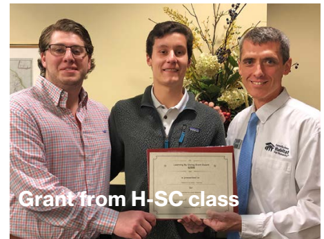
Grant from H-SC class

grant from the Philanthropy Class at Hampden-Sydney College, a house sponsorship program for construction of that home is now underway. Continued support from Kyanite Mining and the Melvin C. Draft Foundation is also vital to the local work.