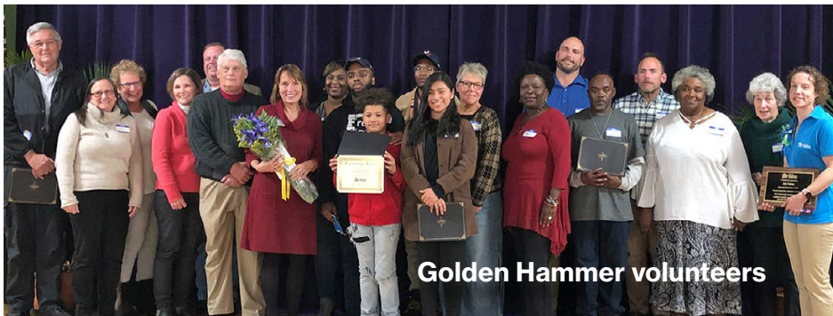
Golden Hammer volunteers