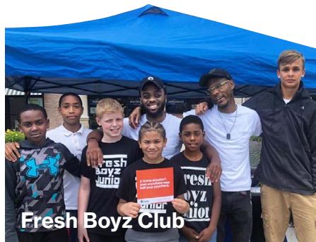
Fresh Boyz Club

The local work also depends on many financial supporters, such as the longtime assistance of the Walter J. Payne Foundation, the United Way of Prince Edward, and the Prince Edward County government.