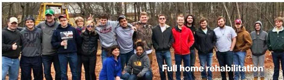
Full home rehabilitation