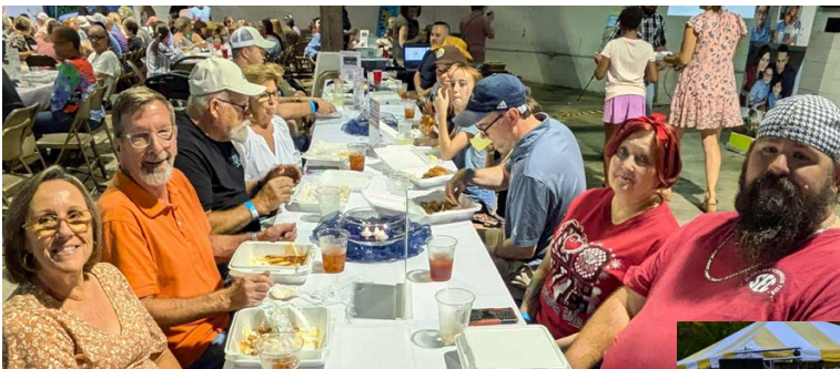
Fun at the Pig Roast!

Mark your calendars now for next year’s night of fun — Saturday, September 27. We will see you there.