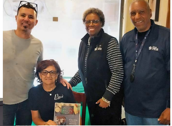
Below, Charlotte and Prince Edward county committees hosted two bingo events