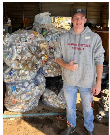
Cans from Hampden-Sydney College