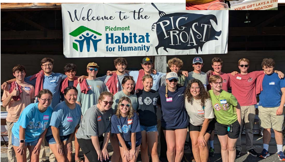
Longwood University and Hampden-Sydney student volunteers