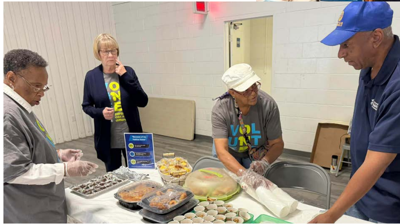
Above, Nelson Health Fair Left, Taste of Farmville