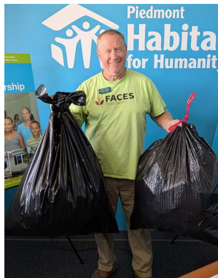
Cans from FACES

DURING A SEVEN-MONTH PERIOD, Novelis Inc. presented Habitat for Humanity affiliates nationwide with the potential of earning a $2,500 grant if the affiliate could recycle at least 500lbs of aluminum cans. Many thanks to Hampden-Sydney College, FACES and our local community for partnering with us this year to recycle the cans. We went above and beyond our goal and recycled almost 600lbs of cans! It takes about 32 empty cans to make one pound, so that comes out to about 19,000 cans collected and recycled!