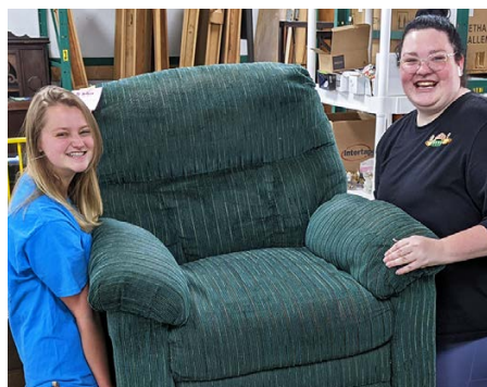
Delta Sigma Pi Business Fraternity