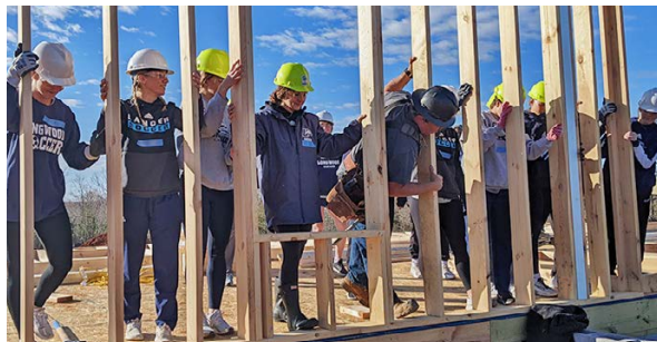
Longwood women's soccer team

Thanks to local supporters, these same great outcomes are happening right here at home. Whether it is sharing financial resources, time,