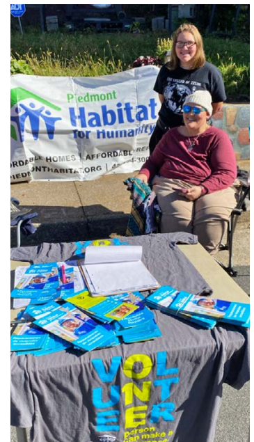
Lovingson Street Festival