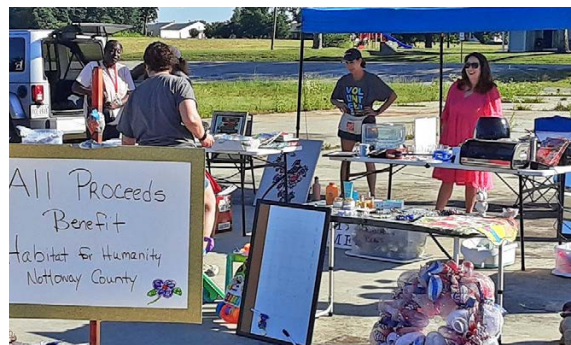
Nottoway Yard Sale