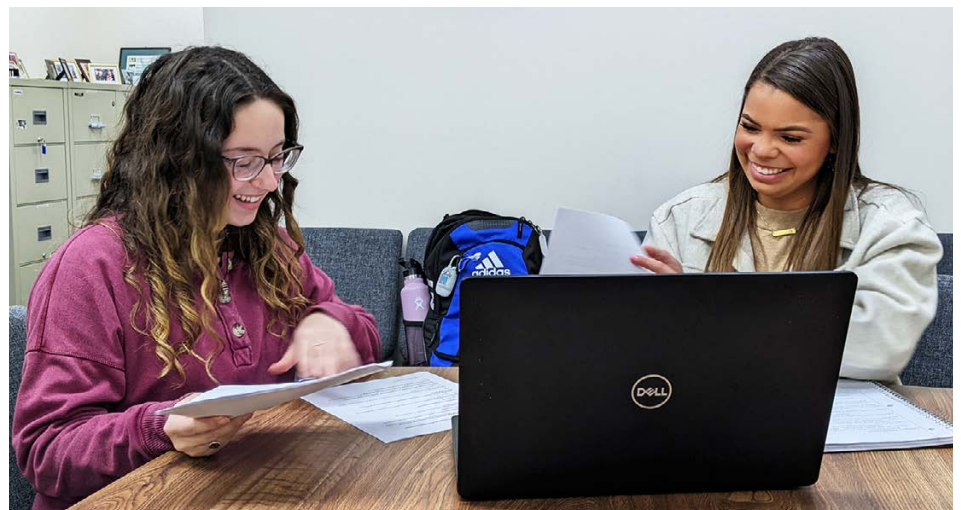
Longwood interns working on survey

Reflecting on their overall satisfaction, an overwhelming number of homeowners responded they could never imagine living anywhere else. One homeowner commented that her affordable mortgage gave her the opportunity to go back to school and receive her master's degree. The survey