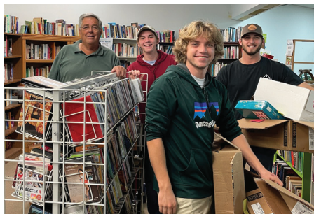
Hampden-Sydney Chi Phi volunteers

This year, the ReStore enjoyed an amazing opportunity, thanks to