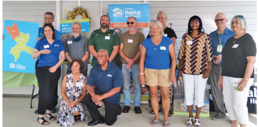
Nelson update event

celebration, enjoying talking with many who stopped by their booth. The Cumberland committee held its first annual Cumberland Bazaar, a gathering of local vendors and crafters, hosted at Fitzgerald Memorial Baptist Church. Up in Nelson, the group hosted an outdoor event at Pine Hill Baptist Church to inform the community about Habitat services. The Nottoway team partnered with the Blackstone Volunteer Fire Department for the Nottoway Kick-Off event,