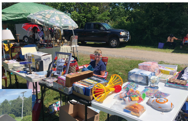
Below, Nottoway Kick-Off event and Buckingham Juneteenth