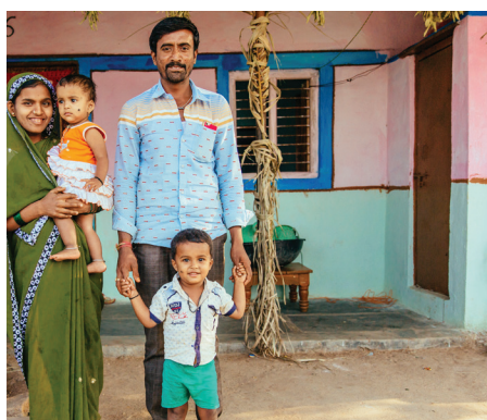
Habitat home in India

CLARENCE JORDAN, the pioneer of the movement that helped birth Habitat for Humanity, once said, "It is not enough to limit your love to your own nation, to your own group. You must respond with love to those outside of it.... This concept enables people to live together not as nations, but as the human race." Based on the Biblical concept, every Habitat affiliate has the opportunity to give a portion of their unrestricted funds to the tithe. These funds are used to support Habitat's work around the world. The tithe can be designated to a certain partner country or to one of three general funds: the Global Mission Fund, the Orphans and Vulnerable Groups